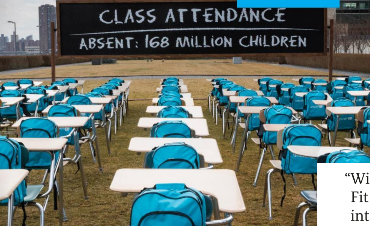
UNICEF 2021: COVID-19 and School Closures, One year of education disruption, March 2021